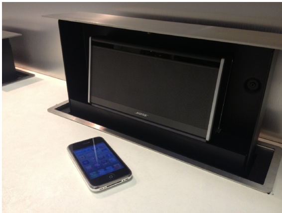
Bose® Soundlink II unit included