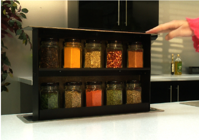
includes jars shown but not contents